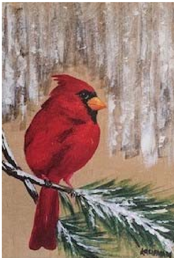
“Big Red” acrylic on mat board, 5 x 7 inches

creating and marketing a variety of watercolor items.