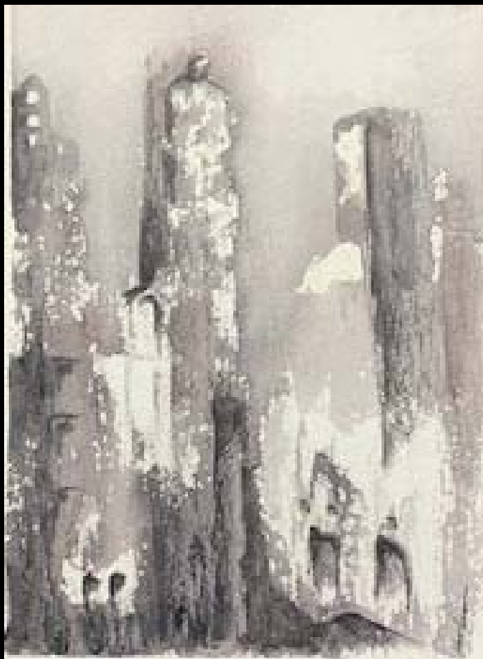
"City of Secrets" watercolor monochrome, 300 # Arches