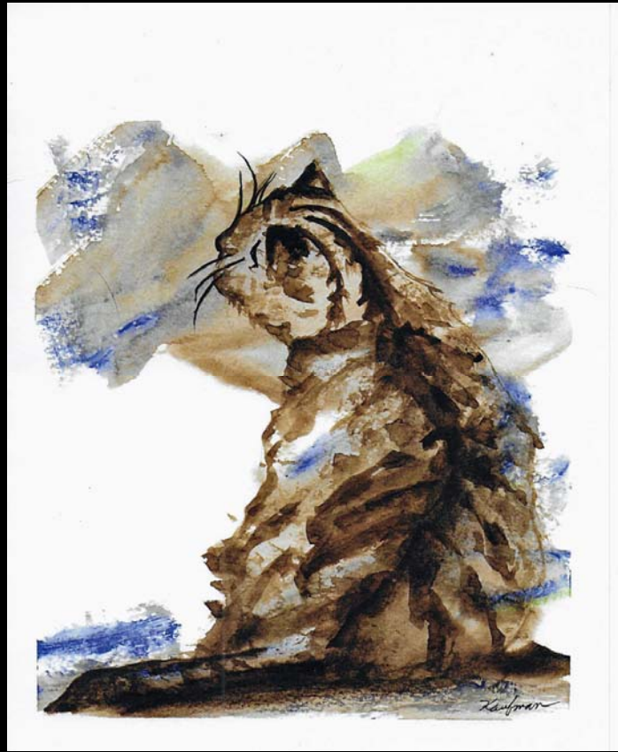
"A Cat for Pat" watercolor, 8 x 10 inches #