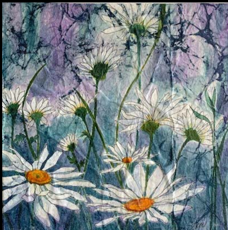
"Kim's Coneflowers" acrylic on canvas, 11 x14 inches