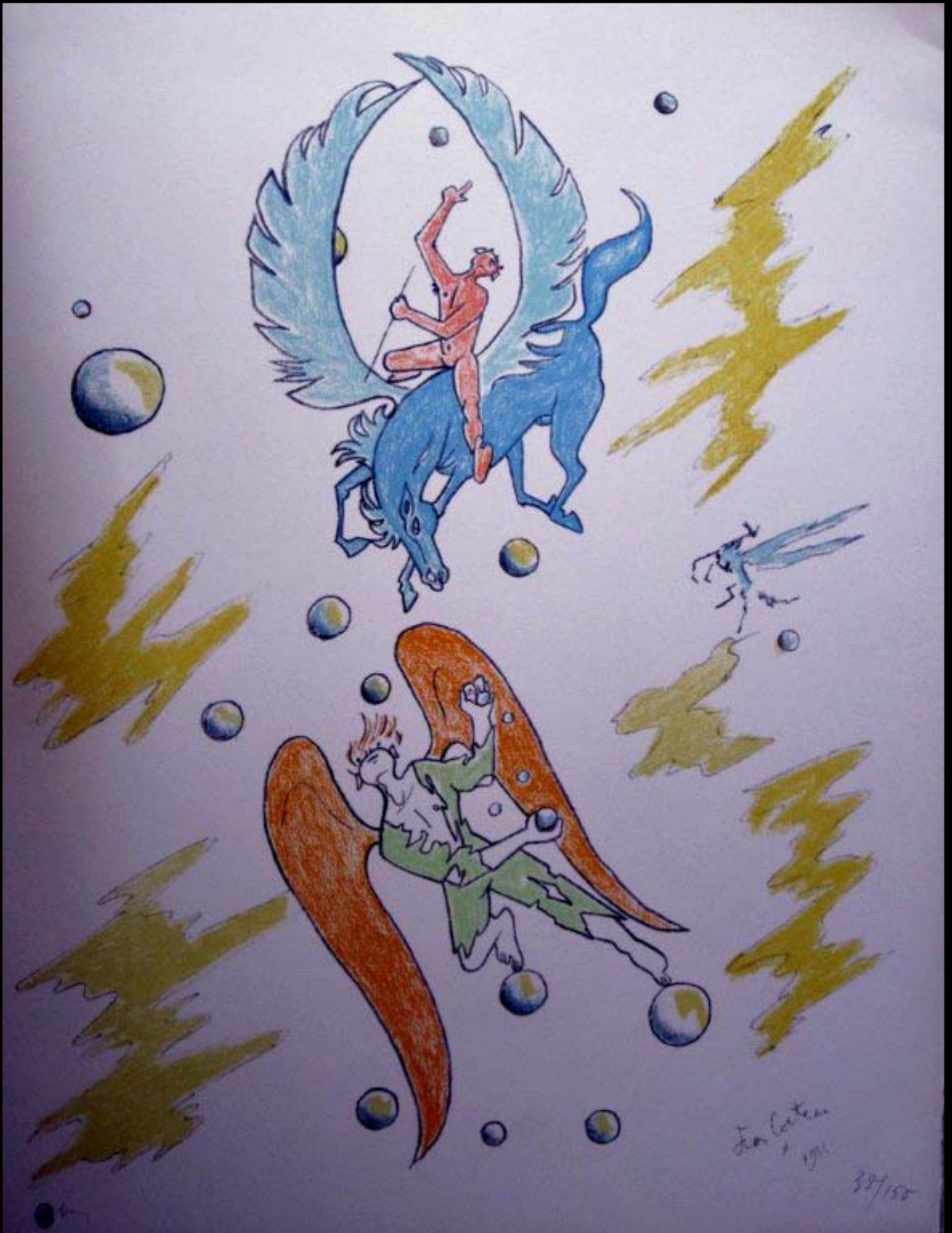
Ceiling of the Salle de Mariage, Menton, France