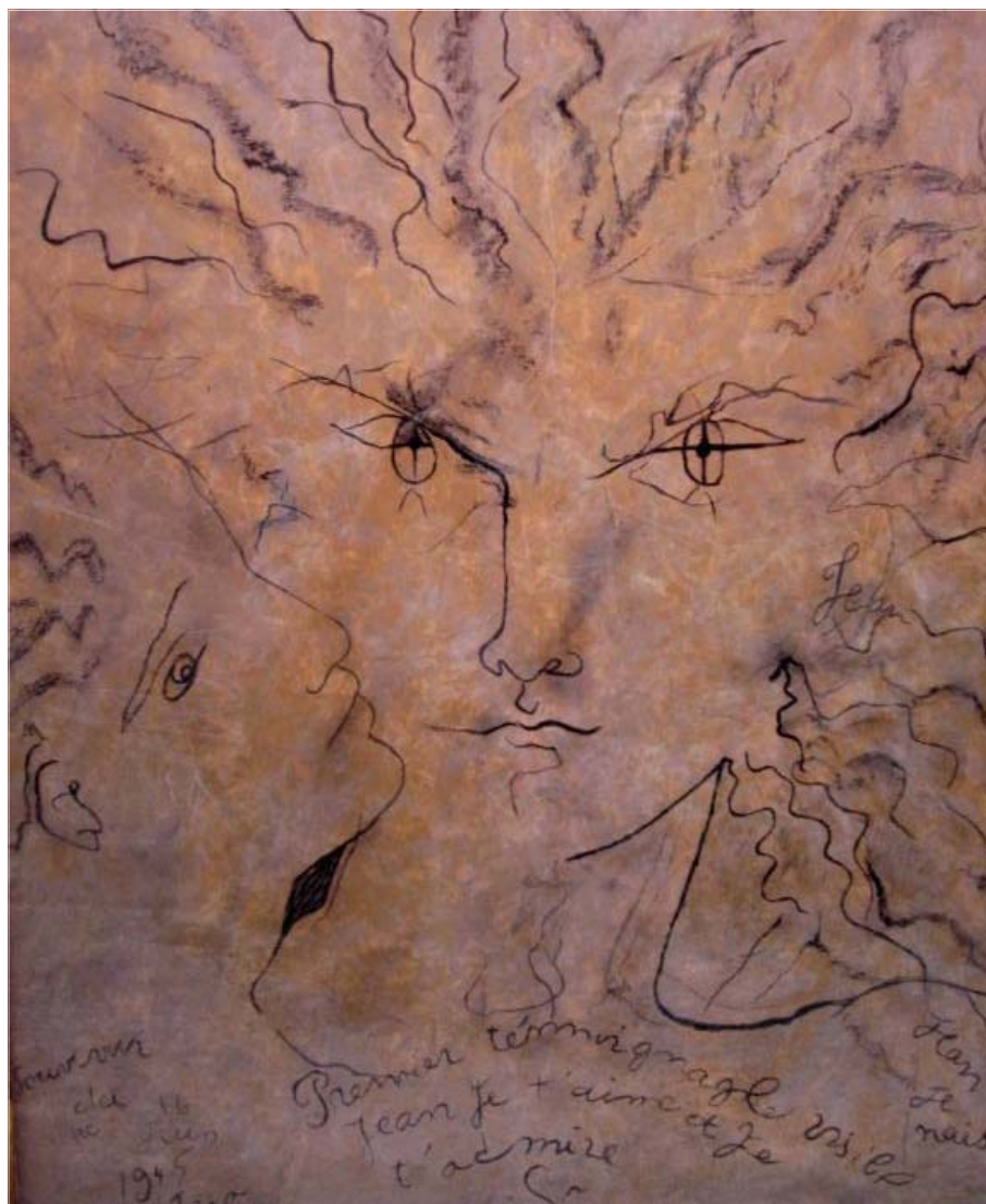
"Remembrance of 1945" dedicated to and portrait of Jean Marais